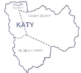
HUB CITY OF THREE COUNTIES